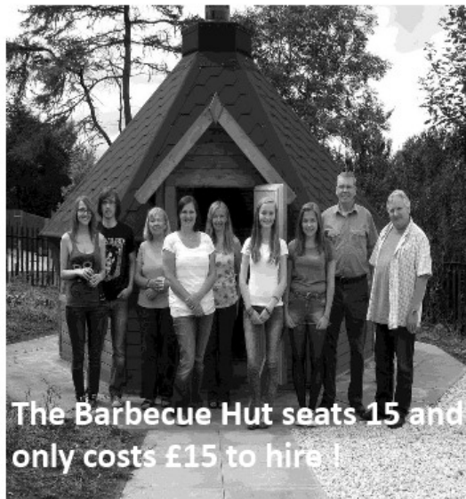
The Barbecue Hut seats 15 and only costs £15 to hire!

Lamanca Hub is a family-friendly community centre which has two multi-purpose halls (recently re-decorated), a community garden, a children's play area and a Scandinavian Barbecue Hut. Recent events at the Hub include a Christening Party and birthday parties where the BBQ hut was included in the package. We also have first-aid courses organised by a fully qualified paramedic.